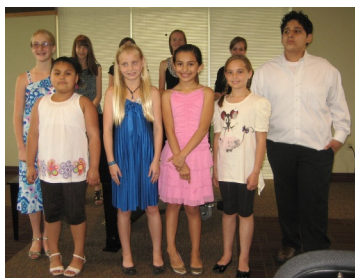
2011 Piano Bank Recipients

The Wisconsin Foundation for School Music and Steinway Piano Society provide pianos to students who are not able to afford a piano. If you know of a student who would benefit from applying for a piano, click here .