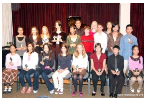
2010 winners, age 12 and up

Rhapsody Arts Center is pleased to announce the Eleventh Annual Sonatina Festival! The event raises awareness, appreciation, and understanding of the sonata and sonatina musical forms, and promotes music education.