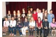
2009 Sonatina Festival Finalists

The annual event raises awareness, appreciation, and understanding of the sonata and sonatina musical forms and promotes music education. The competition is open to students of all ages and levels of study from Wisconsin, Illinois, and Iowa. Last year's festival included 168 entrants with 53 finalists and $400 awarded in scholarships.