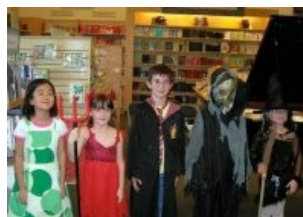
Calling all piano-playing ghouls and ghosts!

You can download posters for your studio and coupons to use on October 30 only. Barnes & Noble will donate a portion of the day's profits to the American Family Children's Hospital. These can be copied and given to your students.