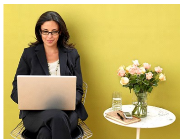
For the first time, MAPTA members had the option of taking an online member survey

58% of our members responded to the survey which was made available to members via mail and, for the first time, online. This was a far higher response rate than any previous MAPTA survey, proving that MAPTA members are more involved than ever before. The tone indicated that members appreciated being heard, highly value MAPTA programs and have lots of suggestions for the future.